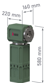
iIPSC-PT-005 base model