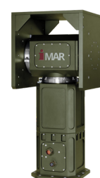
iIPSC-PT-030 with customized payload frame