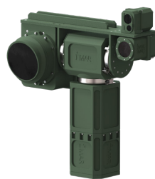
e. g. iIPSC-PT-010 with optical sensors