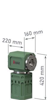
iIPSC-PT-003 base model