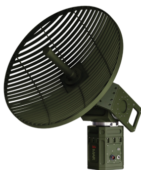
e. g. iIPSC-PT-003 with grid antenna