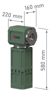
iIPSC-PT-005 base model