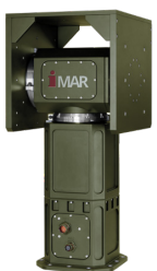
iIPSC-PT-030 with customized payload frame