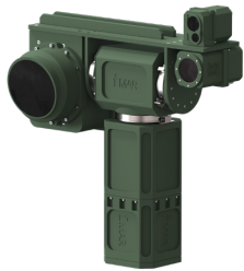
e. g. iIPSC-PT-010 with optical sensors