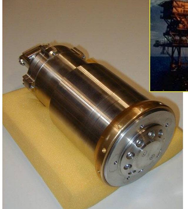
iPST-RQH-003 with ring laser gyros for 10" pipeline (built for an wellknown German pipeline inspection company)

With the help of Inertial Navigation Technology the position of a