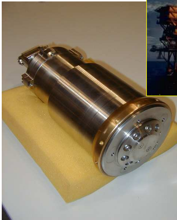
iPST-RQH-003 with ring laser gyros for 10" pipeline (built for an wellknown German pipeline inspection company)

With the help of Inertial Navigation Technology the position of a